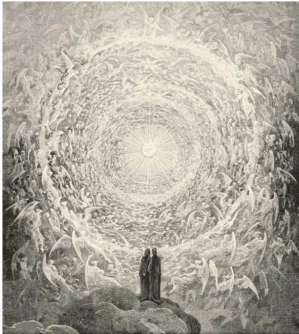
Paradiso Canto XXXI, Gustave Dore (Public Domain)

NON-PROFIT ORG. U.S. POSTAGE PAID SEATTLE, WASH PERMIT NO. 7207